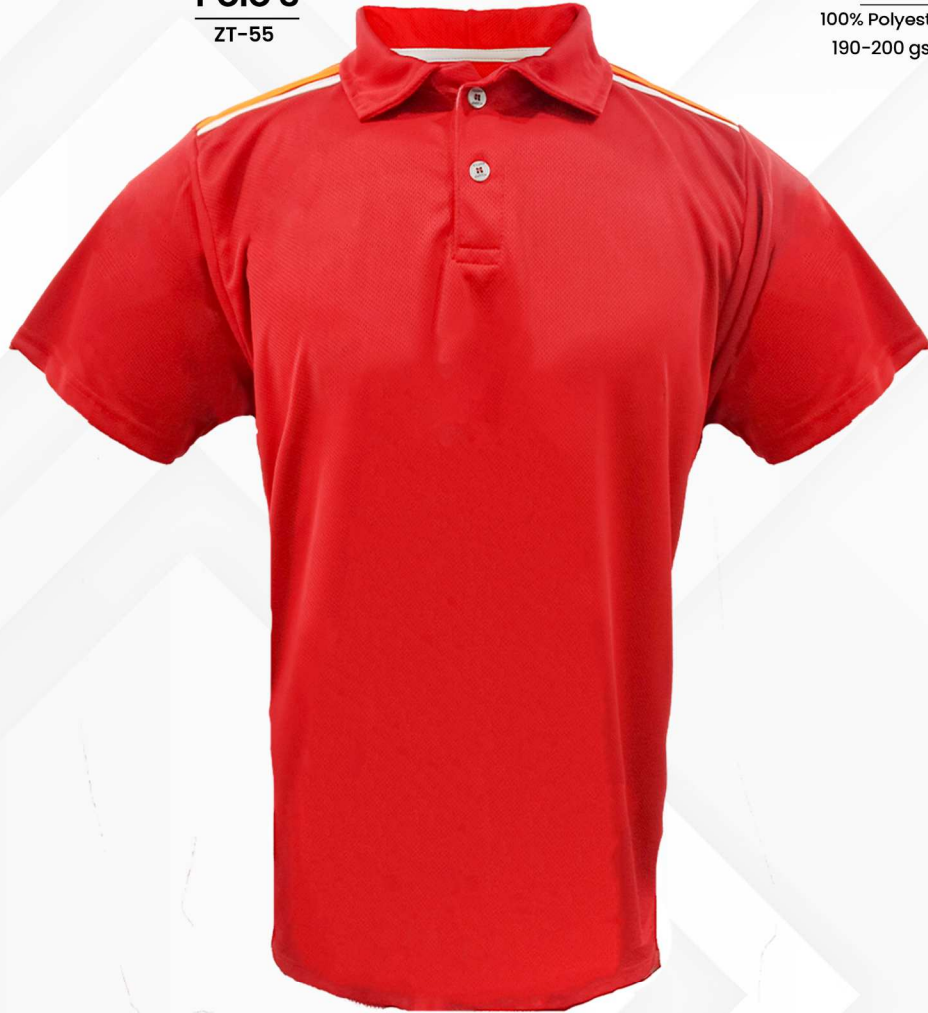
Polo 3 ZT-55