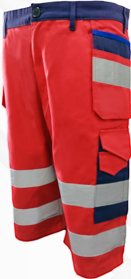
Short 3 ZT-69

DETAILS 65% Poly, 35% Cotton Twill 190-200 gsm