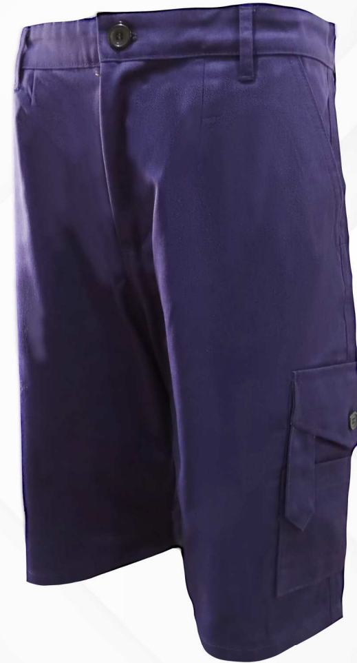
Short 4 ZT-70

DETAILS 65% Poly, 35% Cotton Twill 260-270 gsm