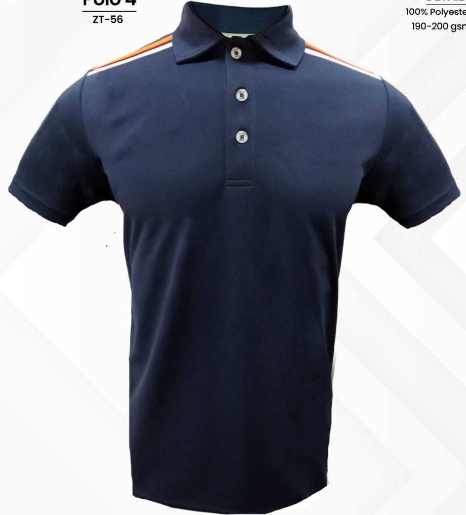
Polo 4 ZT-56