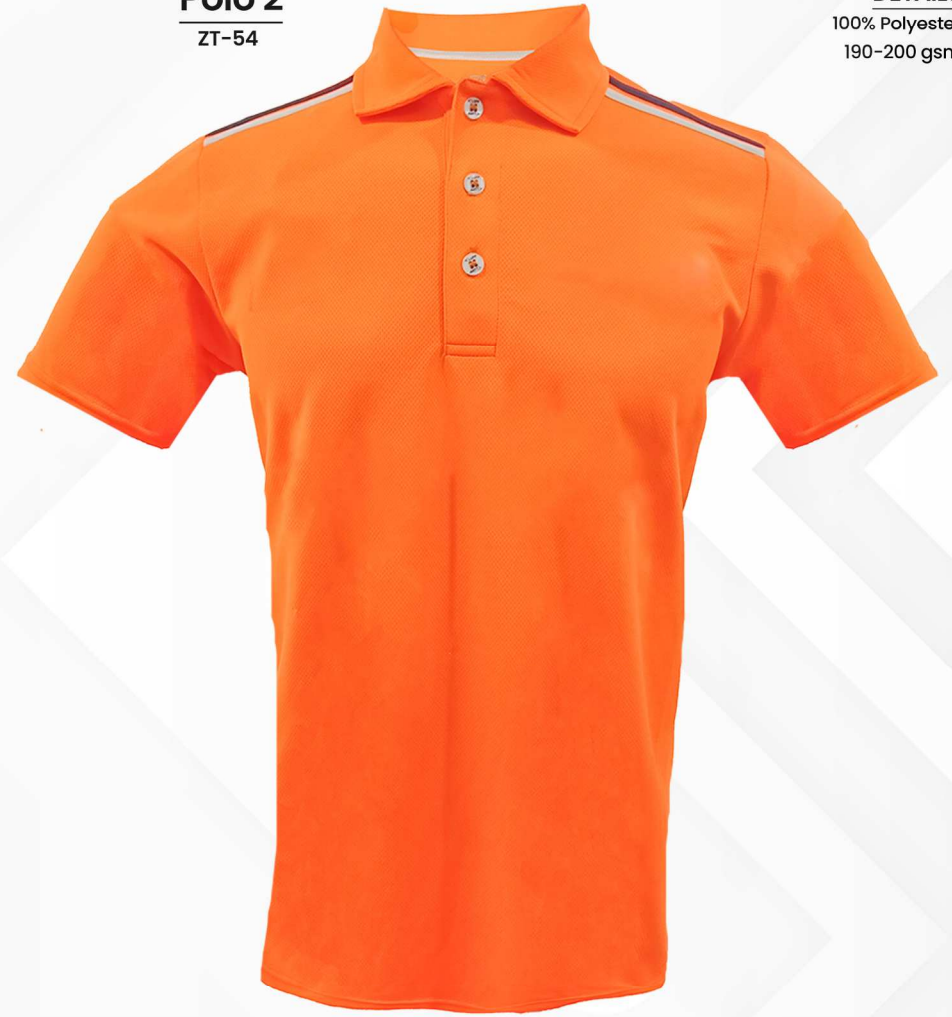
Polo 2 ZT-54