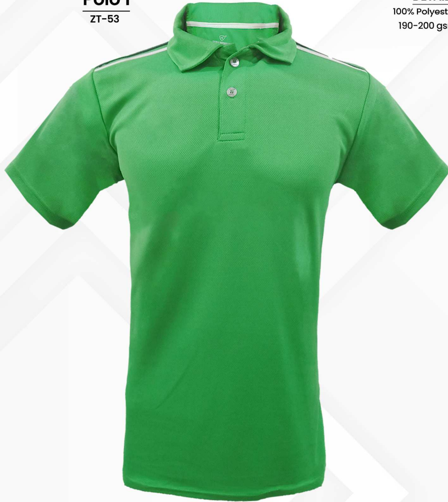
Polo 1 ZT-53