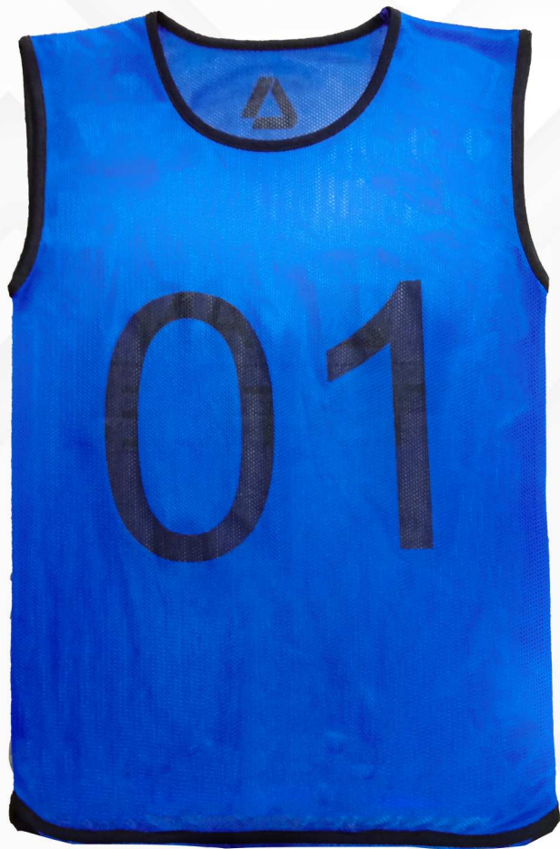
Bib - 01 ZT-75