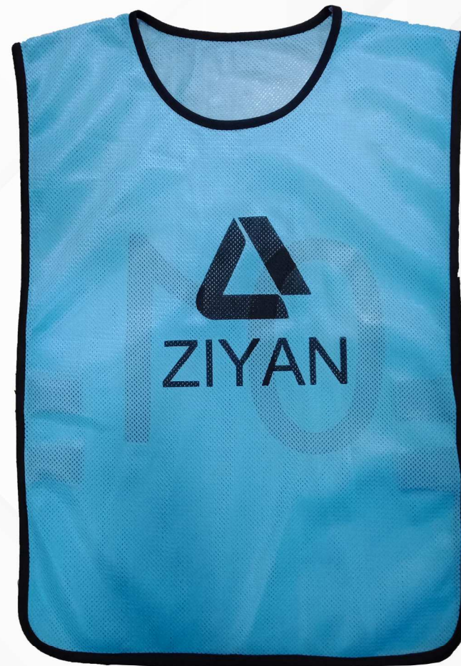
DETAILS 100% Polyester 95 gsm