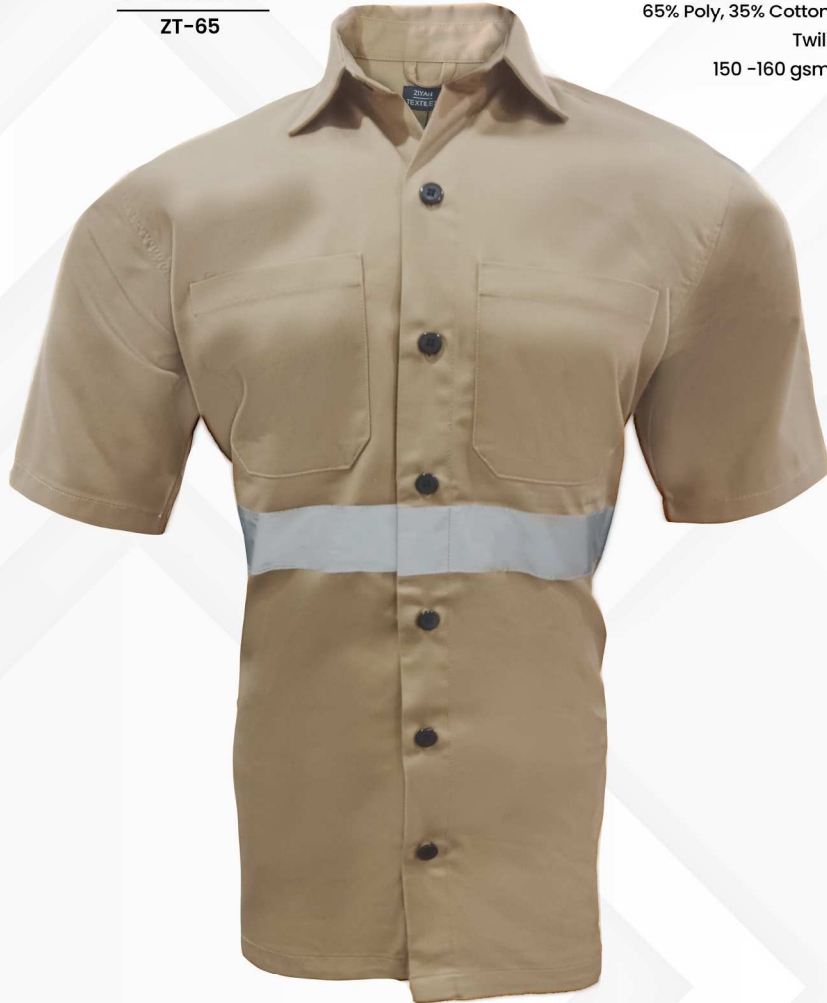
T-Shirt 5 ZT-65

DETAILS 65% Poly, 35% Cotton Twill 150 -160 gsm