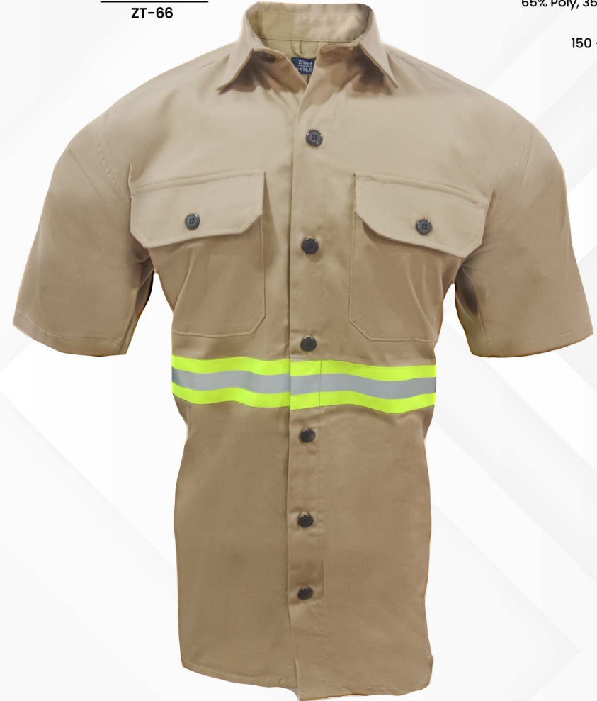
T-Shirt 6 ZT-66

DETAILS 65% Poly, 35% Cotton Twill 150 -160 gsm