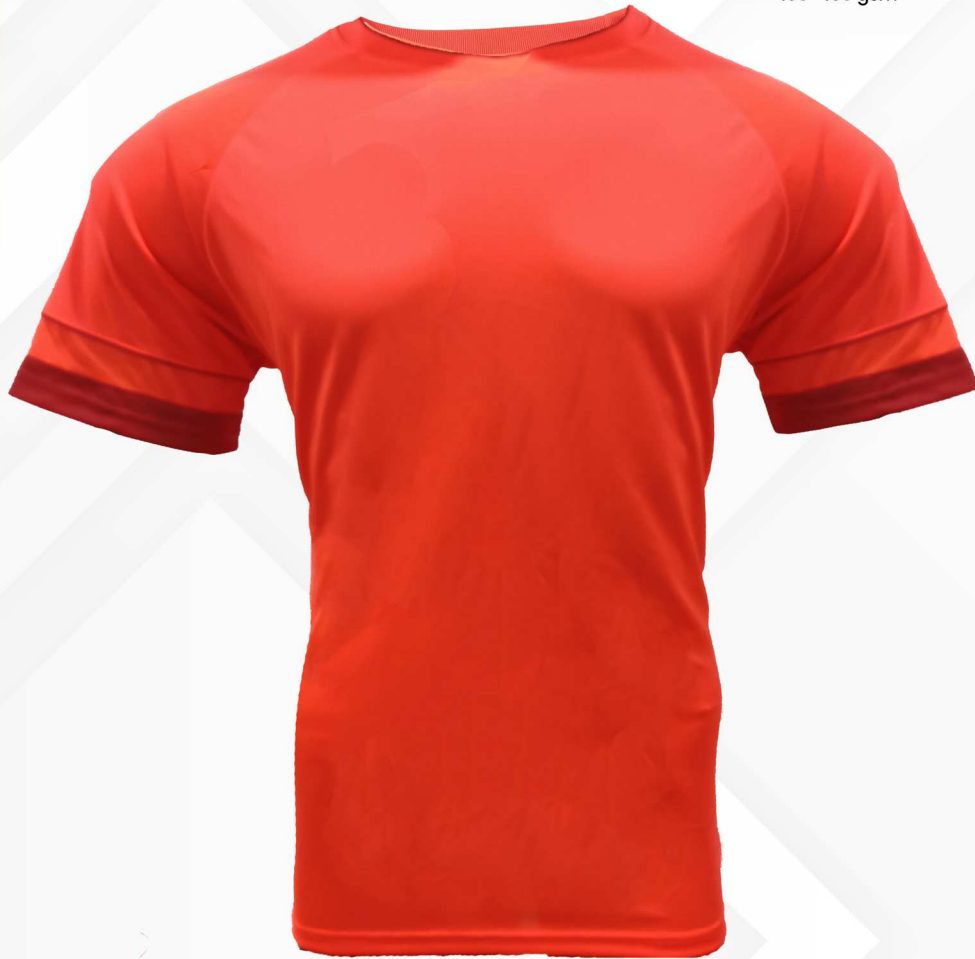
T-Shirt 3 ZT-63