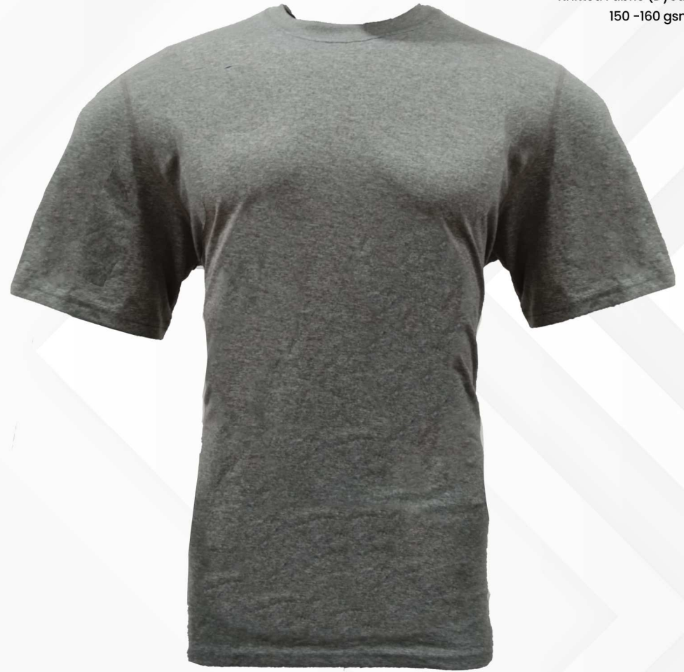
T-Shirt 4 ZT-64

DETAILS 52% Poly, 48% Cotton Knitted Fabric (Dyed) 150 -160 gsm